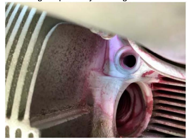
I then super cleaned the area and left the cylinder clean for the IA to reinstall the parts.

but being there, shows up in the process, indicating we probably did it right.