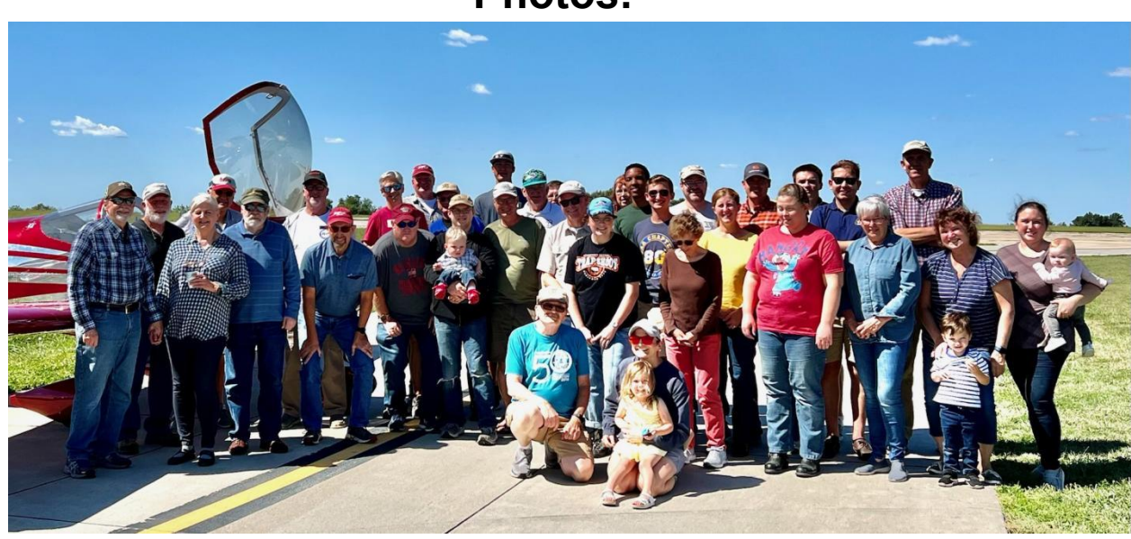
A group photo from the Chapter picnic at Plattsmouth.