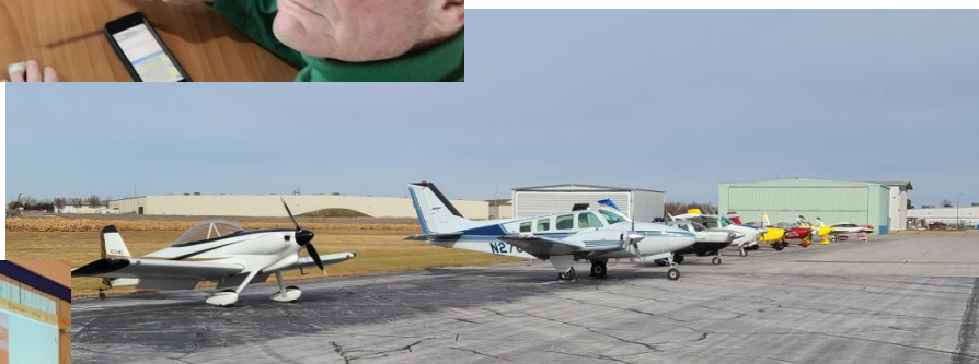
Below : Ramp at KBIE 11/28 (plus a Robinson)