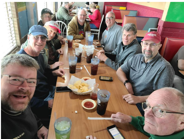
Left: 11/28 Fly Out to Playa Azul in Beatrice