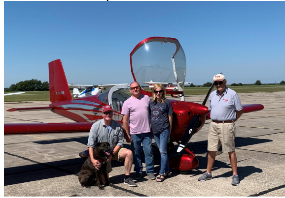
Photos from the Fly-In and Burger Burn at Plattsmouth, September 13, 2020