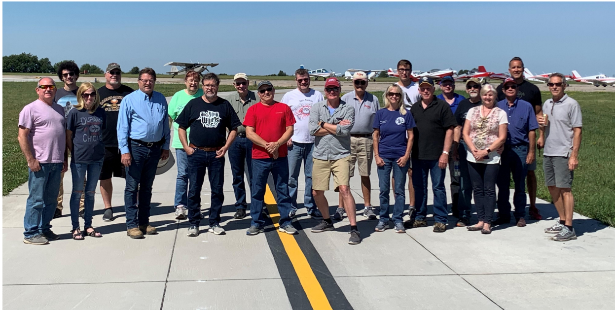
Group photo at the Fly-In/Burger Burn. Thanks all that attended!