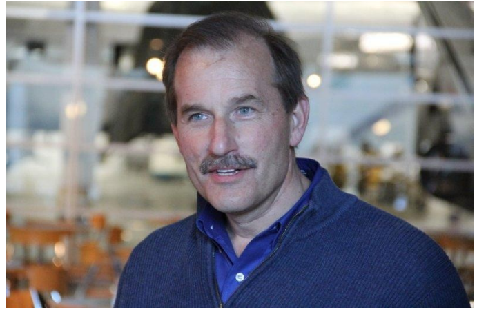
Jeff Skiles - "Miracle on the Hudson"