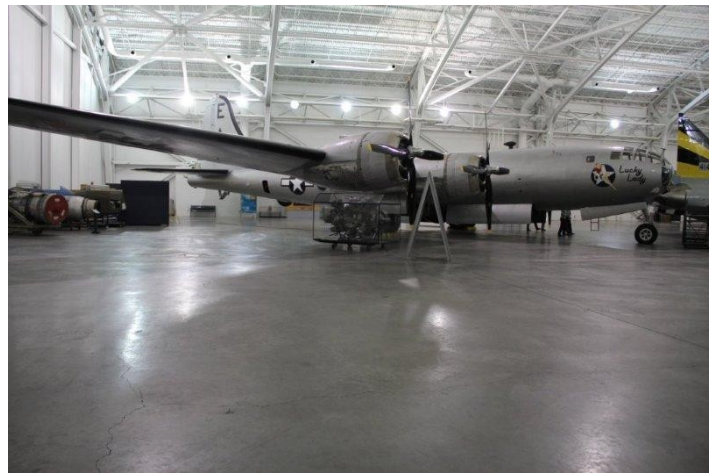
This "Grand Ole Lady" needs no introduction.

Young Eagles Flights - Our last event for the year was scheduled for October 13 but unfortunately the weather refused to cooperate. There are no more rallies scheduled this year.