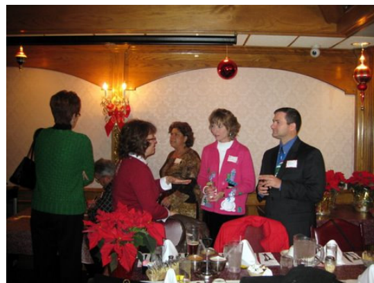
And visiting with friends.