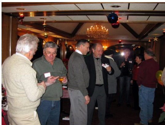
A lot of talking