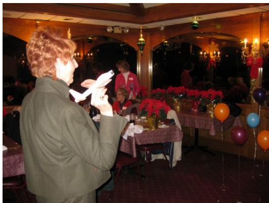
Airplanes were armed and ready for launch —>>>