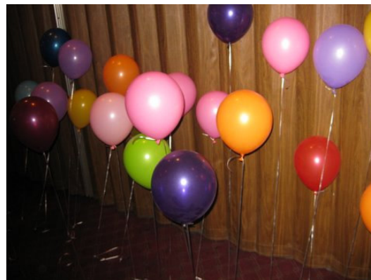
The targets were sighted. Even though helpless, they were hard to hit.