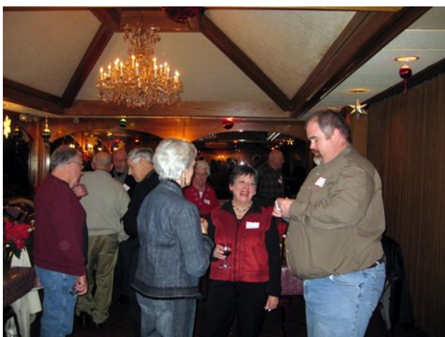
More members and guests having fun.

EVENTS: (B) - Breakfast / (L) - Lunch 1st Sat Chapter 1055 (B) (0800-1000) York, NE 3rd Sat Chapter 569 (B) (0800-1000) Crete, NE