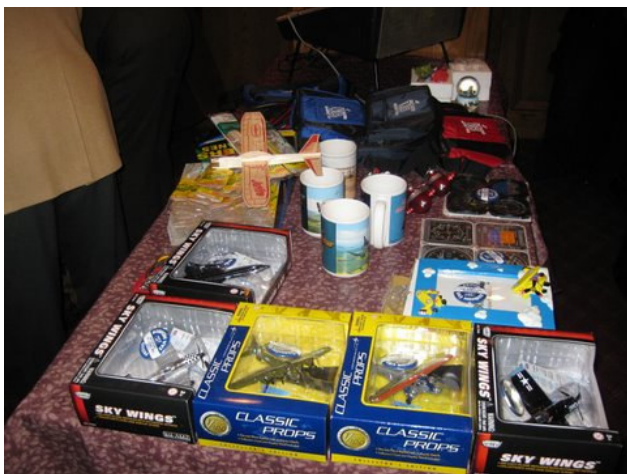
The prizes for those sharp pilots!