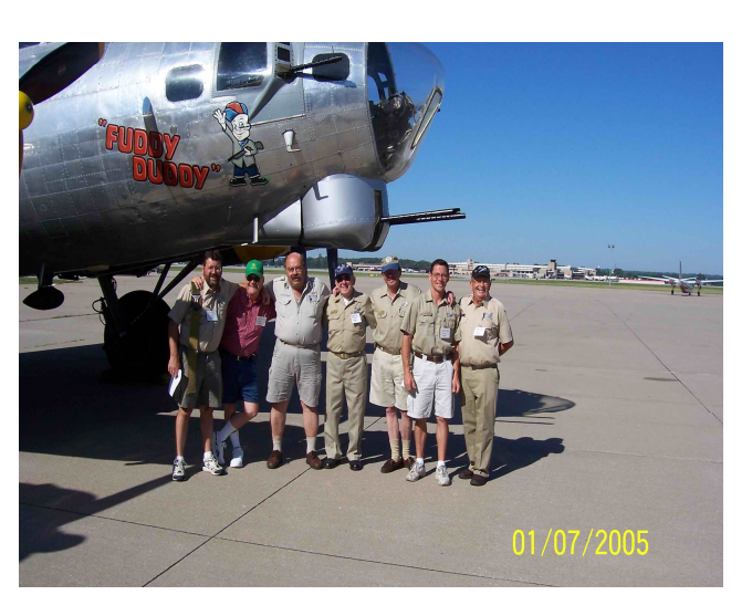
The crew and staff of the Fuddy Duddy. Thanks guys!